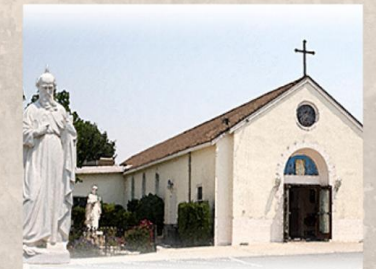
ST. JUDE 208 W. Jefferson Ave. Easton, CA. 93706 Wednesday, April 1st Miércoles 1 de abril

There will be 3 Priest hearing confessions on these dates