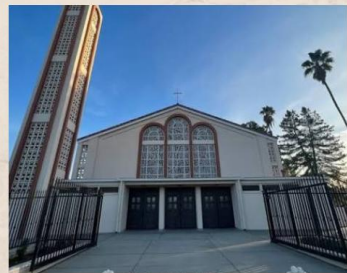
ST. HELEN'S 4870 E. Belmont Ave. Fresno, CA. 93727 Tuesday, March 31st Martes 31 de marzo